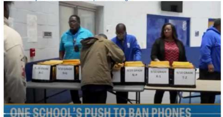
Photo of Dayton Ohio file method phone storage

Dayton Ohio (550 students)high school File folders arranged alphabetically by grade